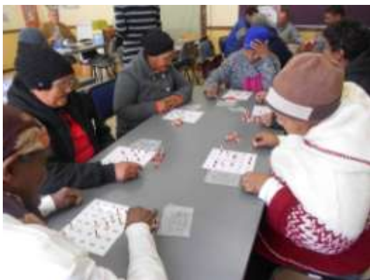
BINGO REENBOOG KLUB