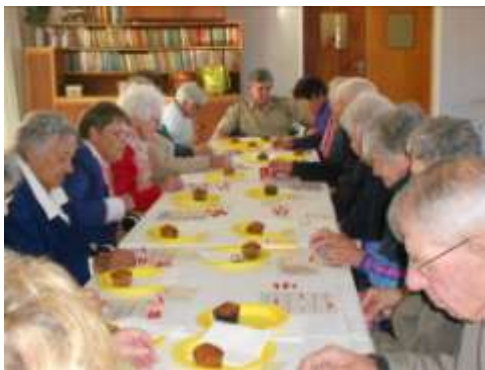
BINGO HAAT 10 AUGUST

Ondersteun asseblief vir Hospice - u sal nie gou weer so 'n heerlike aand van ontspanning, pret en plesier vir slegs R80.00 op die lyf loop nie!