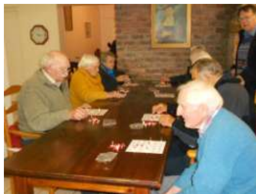
BINGO AAND 14 AUGUST 2013