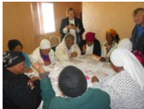
BINGO SILWERKRUIN BEJAARDE KLUB