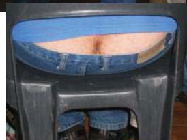
It seems we had an unidentified "Crack" in the hall on Saturday Morning