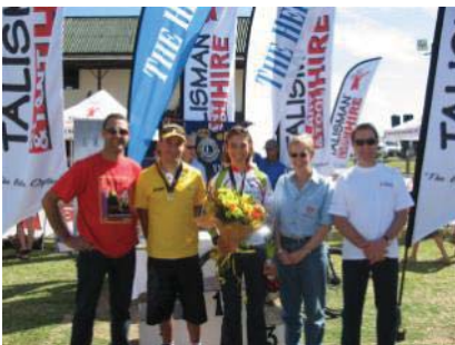
The winning lady and man with Sponsors and Sue