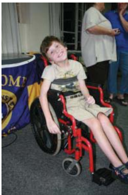
Out with the old