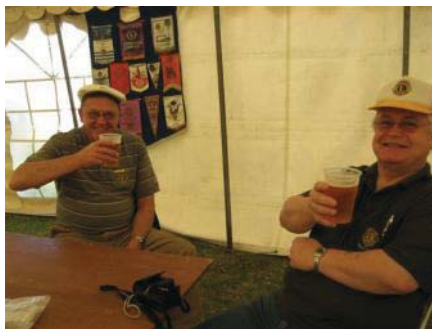
THE REAL HARD PULL