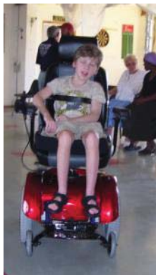
In with the New