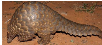
The Latin Name for Pangolin is Pholidota

This goes hand in hand with Rhino Poaching, as the poachers carry pangolin scales for protection